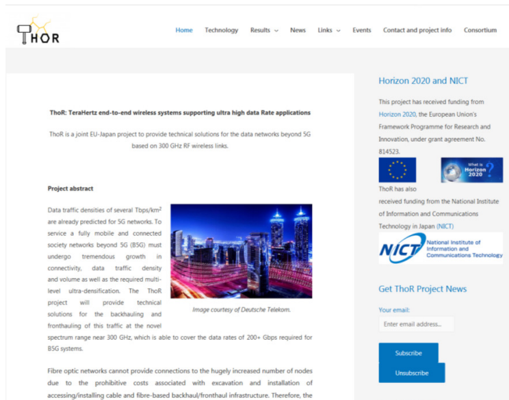
Figure 1: Screenshot from ThoR homepage