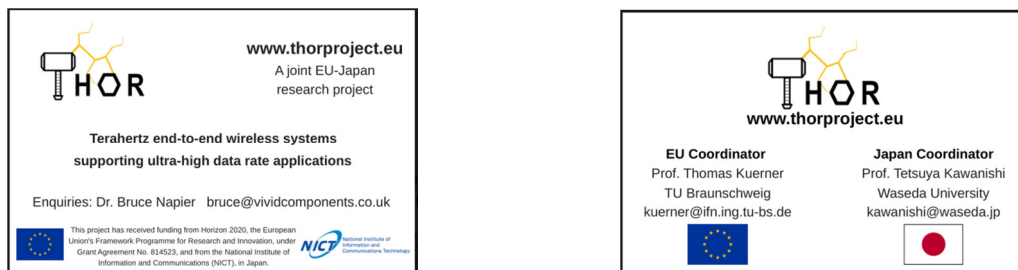
Figure 3: The two sides of the ThoR business cards (NB Black border is shown only for scale.)

[It was agreed that this is a more effective dissemination route than the flyers that were originally planned in the DoA.]