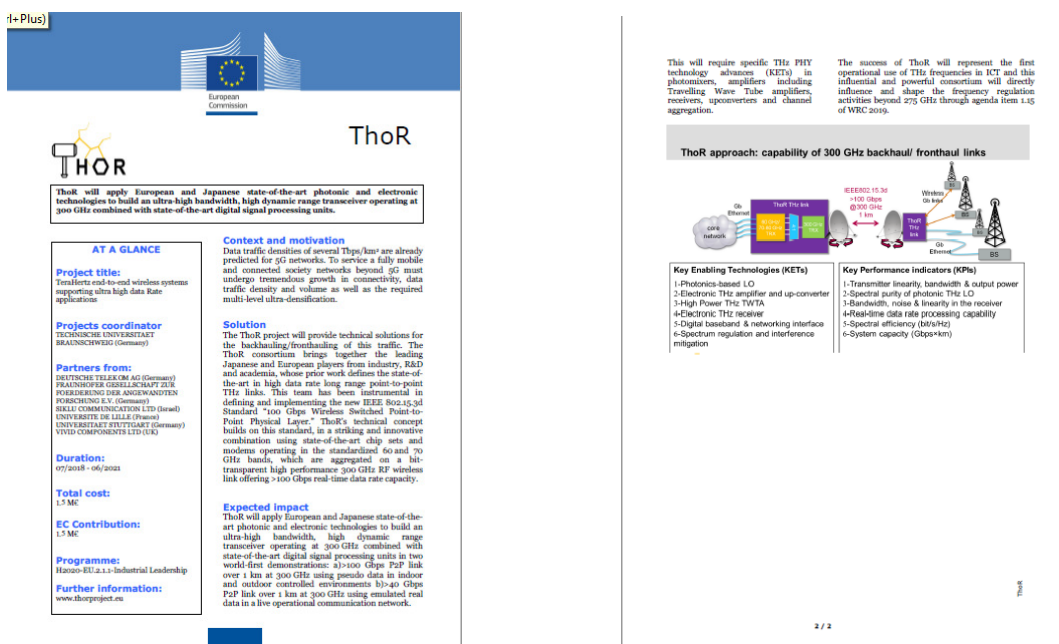
Figure 4: Screenshot of the two-page ThoR fact sheet